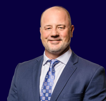
Curtis Harbour Southland Industries